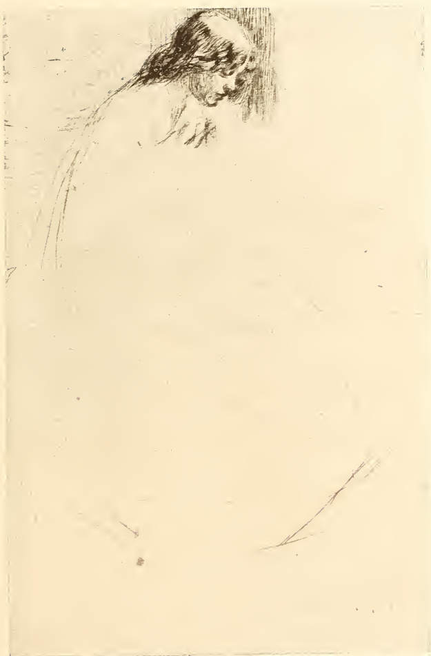
"JO'S BENT HEAD."